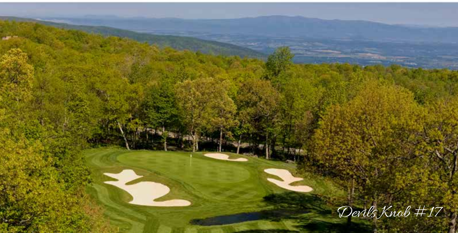
Devils Knob #17